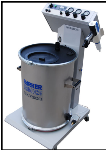
GX7500S—Fluidized Portable Unit