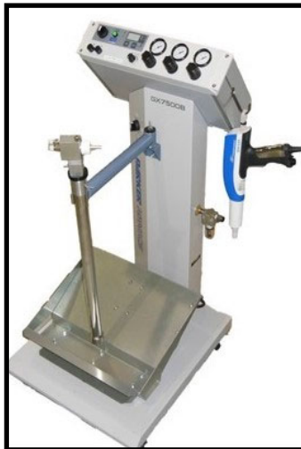
GX7500B—Boxfeed Portable Unit