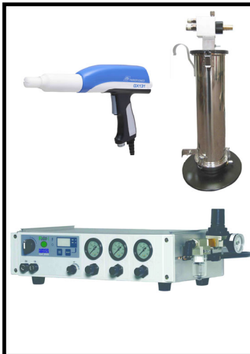
GX7500L— 2 Liter Hopper Unit