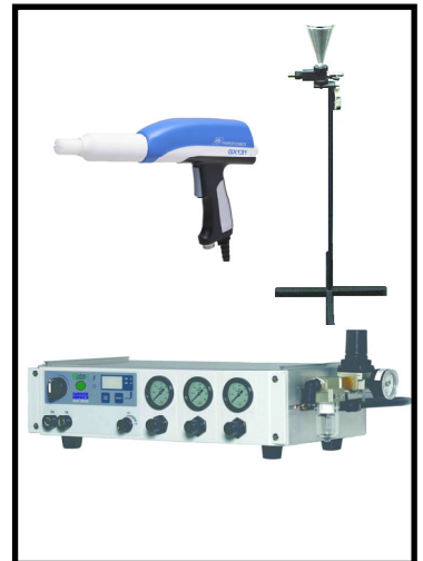
GX7500CS— Cup Stand Unit